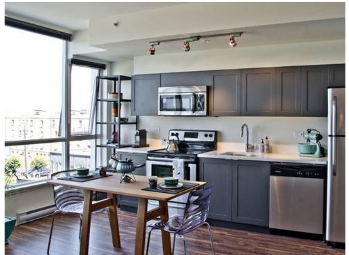
A true dark gray.