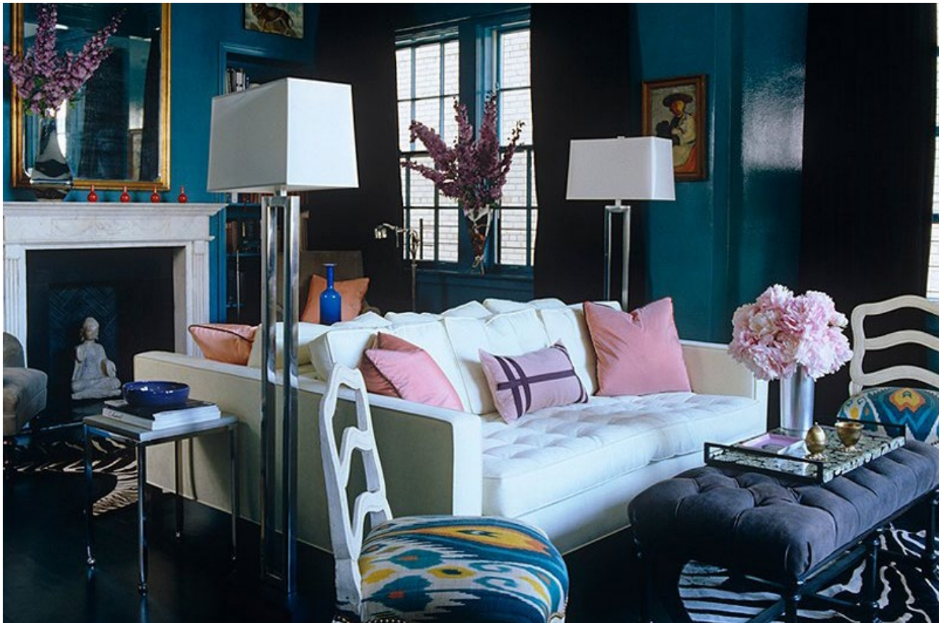
Jewel Tone Living Room