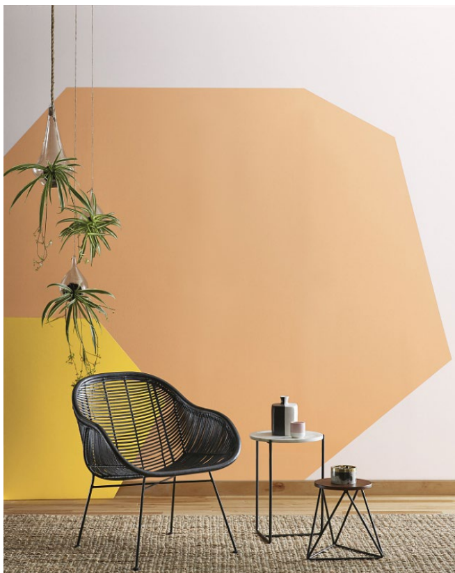
Spirited blush apricot hue is ripe with personality.