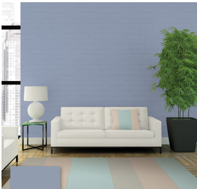
GLIDDEN paint names Byzantine Blue as 2017 Color of the Year