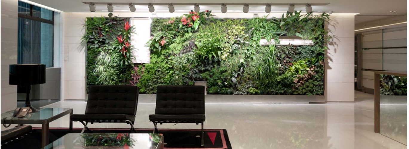
Bring the outdoors inside with a "living wall" (Ronald Lu & Partners Green Wall, Hong Kong)