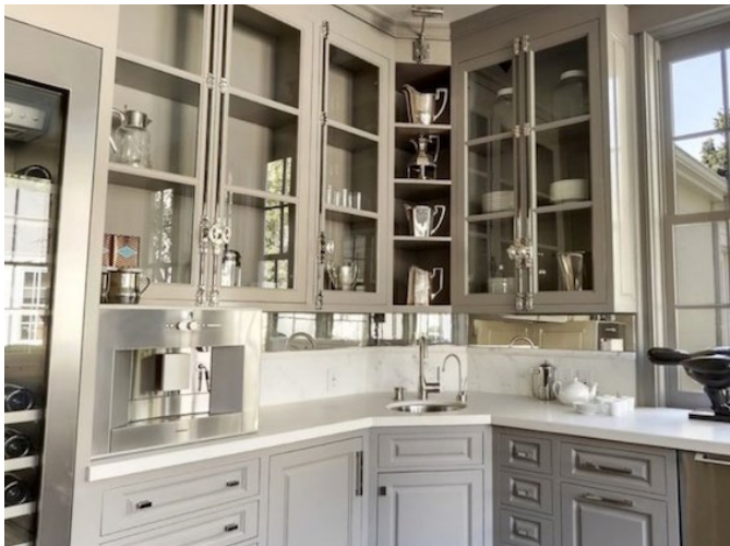
Shades of gray.

Excerpted from: http://www.posturepeople.co.uk/office-furniture-trends-2017/