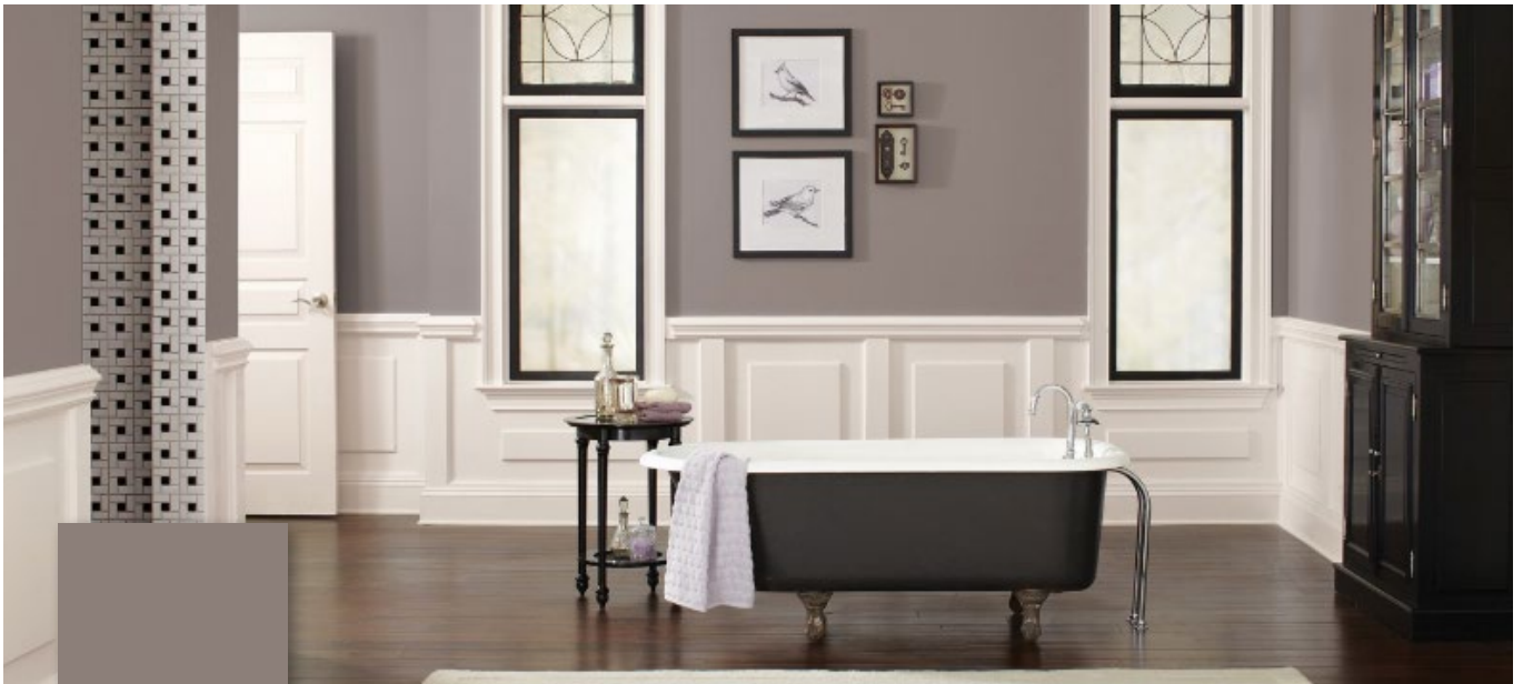
Bathroom in Poised Taupe, Sherwin-Williams 2017 Color of the Year