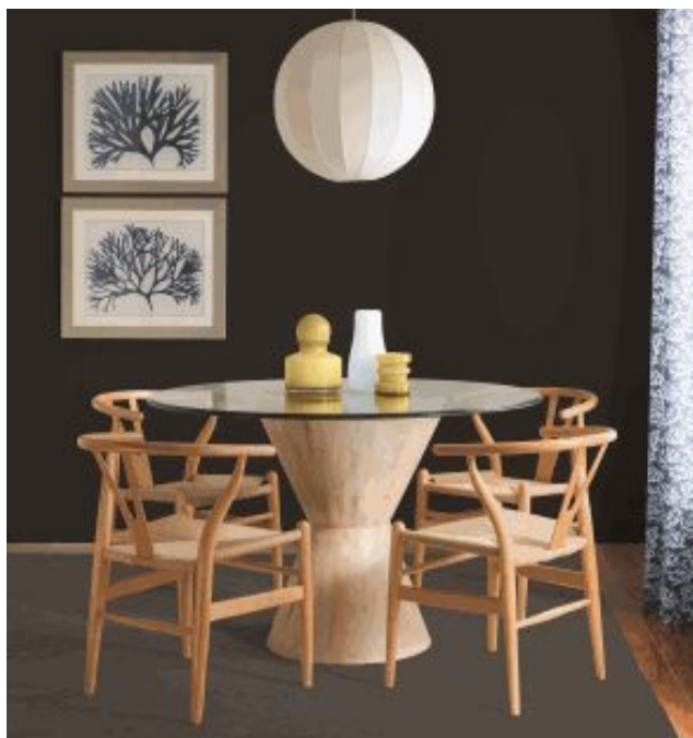
GLIDDEN brand by PPG 2018 color of the year: Deep Onyx ( ppg.com )

Source: http://www.housebeautiful.com/room-decorating/colors/news/a9058/2018-color-of-the-year-predictions/