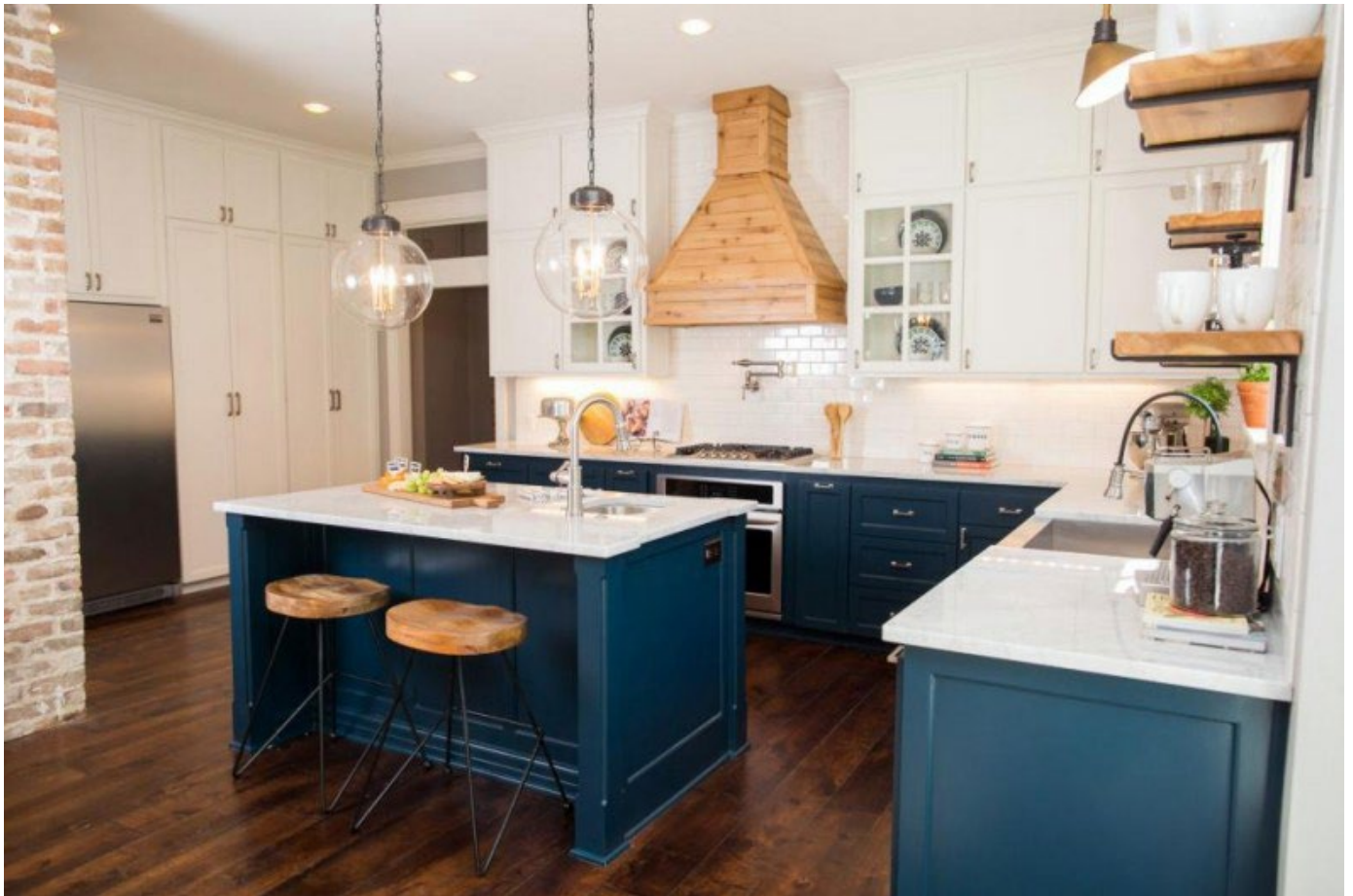
Dark blue and two-toned cabinets will be a hot trend in 2018.