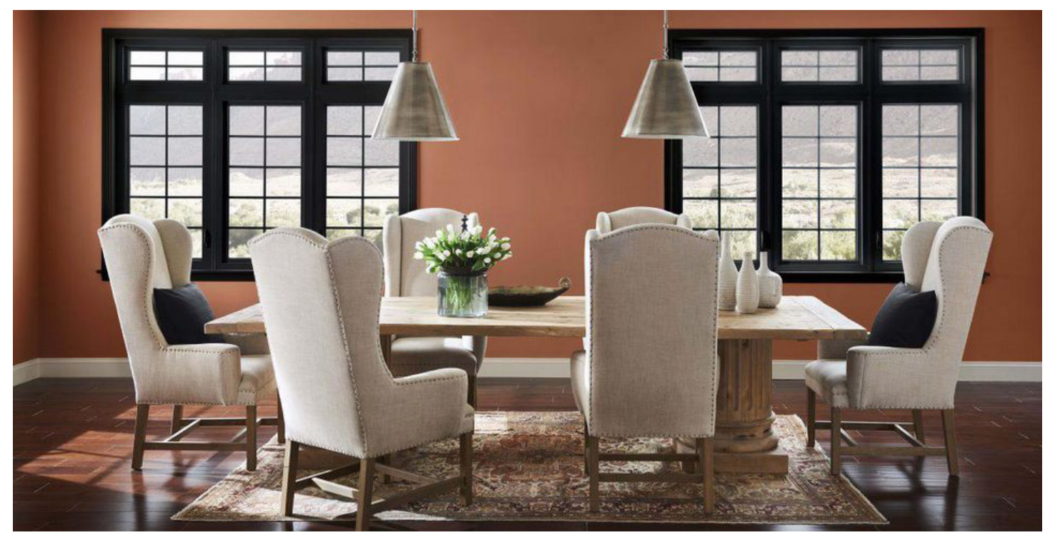
Sherwin Williams Color of the Year: Cavern Clay (forbes.com)