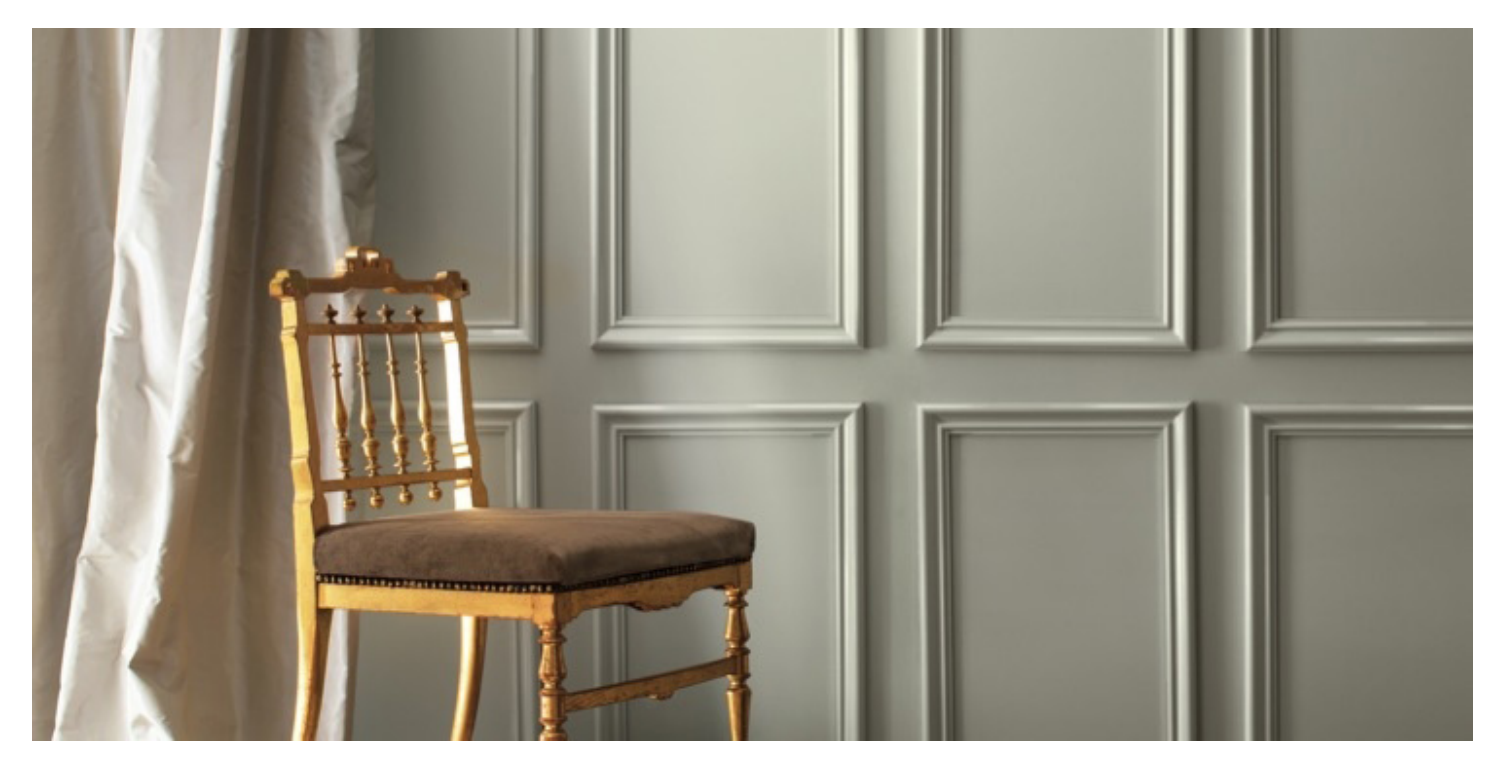
Benjamin Moore Color of the Year: Metropolitan (benjaminmoore.com)