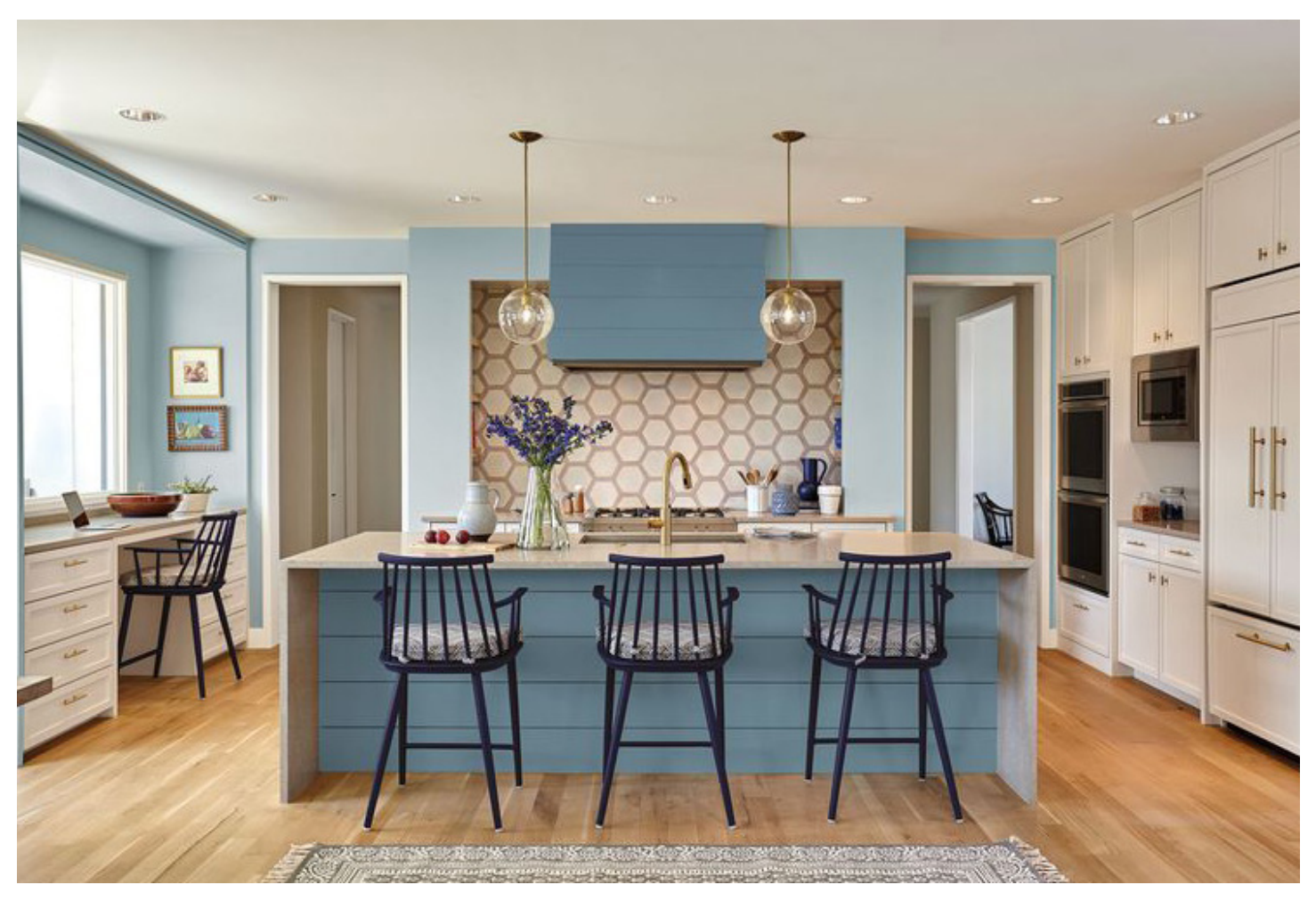
Behr Paint Color of the Year: Blueprint (elledecor.com)