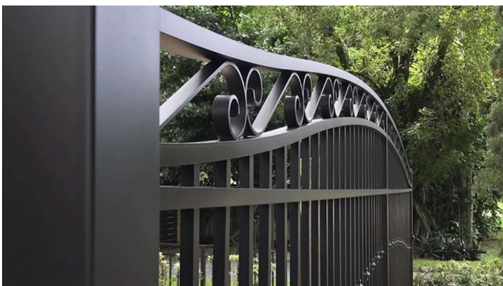
Perfection Electrostatic Paint by Accessa being applied in the field.