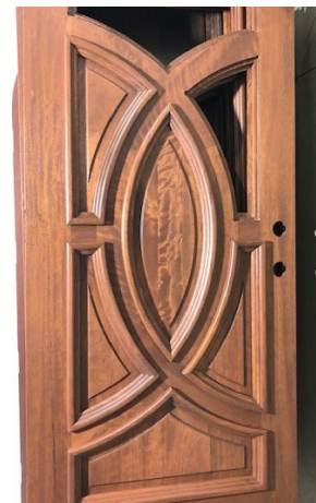
An exterior door finished with the new ICA LA310G30UVE...looking great!