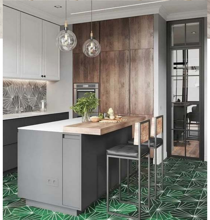
New Décor Trends

During the pandemic, families spent a lot more time in the kitchen. As they rethink how they use that space, homeowners are remodeling and updating their kitchens to better fit their life and their lifestyle.