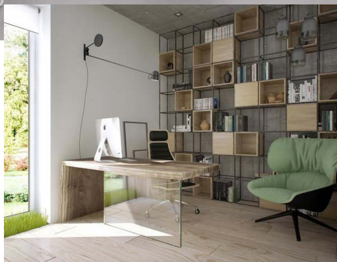
New Décor Trends

Corporate office décor embraces many of the same elements as home office décor in 2022, embracing natural light, colors, fabrics, and materials, and even