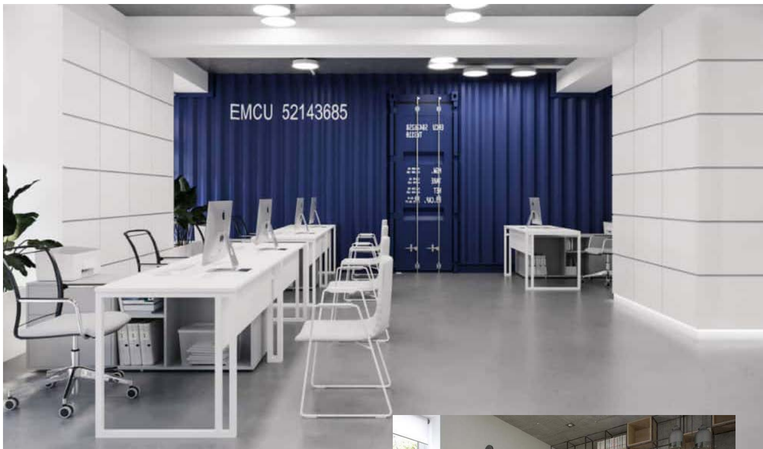
New Décor Trends

After decades of dominance by granite and quartz, butcher block countertops are gaining popularity once again for both their style and substance.